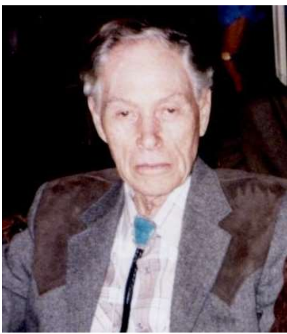
At the 1999 Annual Meeting in San Antonio, TX

Information copied from the <u>Tributes.com</u> web page.